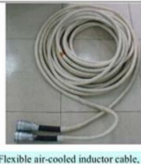
Flexible air-cooled inductor cable.